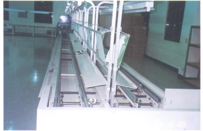
雙併式插入線 TWIN INSERTION C/V