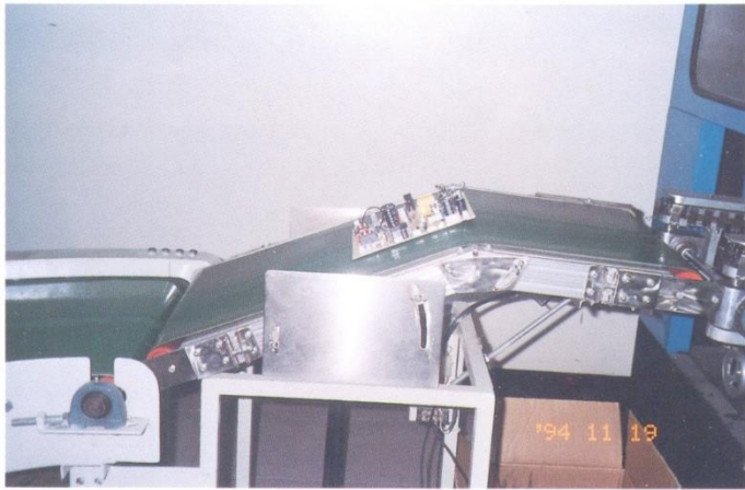
出錫爐皮帶銜接線 SOLDERING OUTLET C/V