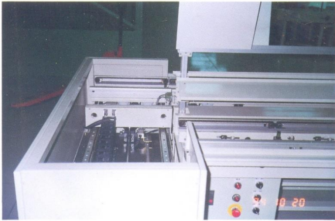
雙併式插入線移載機 TWIN INSERTION C/V WITH TRANSFER